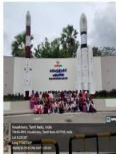
Kavayitri, Tamil Nadu, India 7H4+5H, Kavayitri, Tamil Nadu 627109, India Lat 8.22134° Long 77.56801° 2023/11/27 10:04 AM +05:30