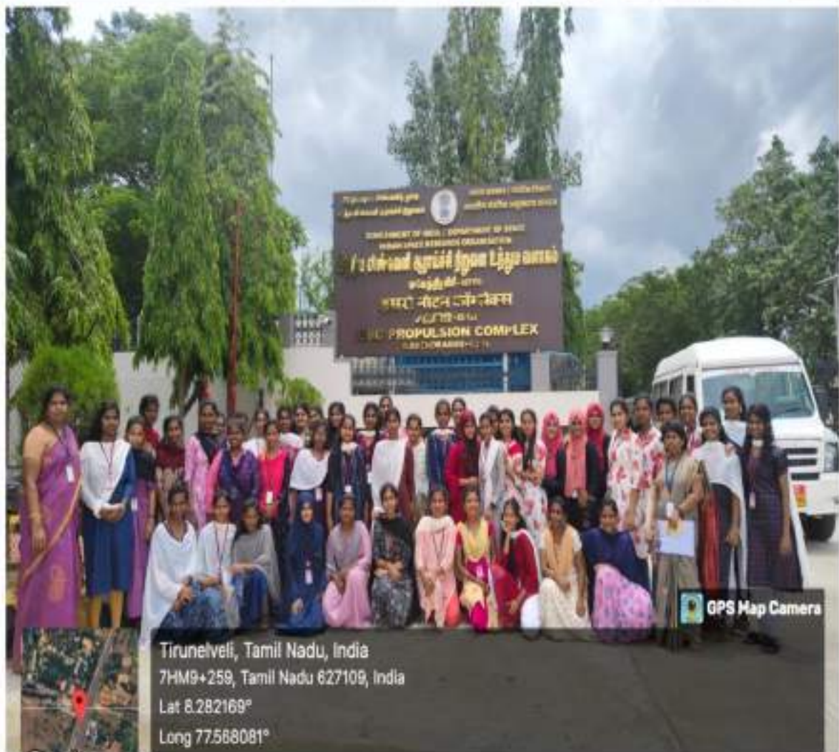
Tirunelveli, Tamil Nadu, India 7HM9+259, Tamil Nadu 627109, India Lat 8.282169° Long 77.568081°