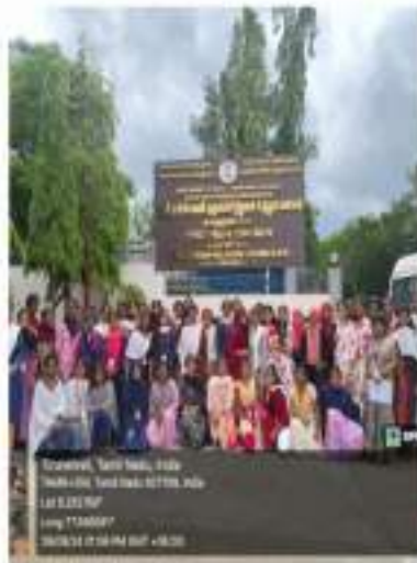
Kavayitri, Tamil Nadu, India 7H4+5H, Kavayitri, Tamil Nadu 627109, India Lat 8.22134° Long 77.56801° 2023/11/27 10:04 AM +05:30