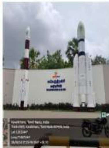
Kavayitri, Tamil Nadu, India 7H4+5H, Kavayitri, Tamil Nadu 627109, India Lat 8.22134° Long 77.56801° 2023/11/27 10:04 AM +05:30